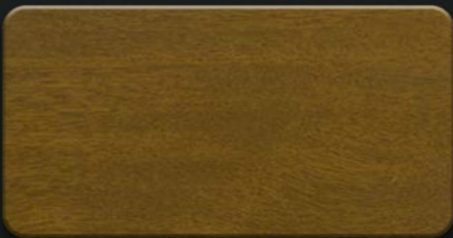
Golden Oak Light